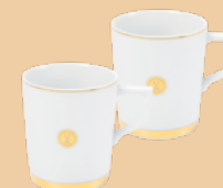
MUG SET, 2-PIECES 2 MUGS 99A372-C4117-1