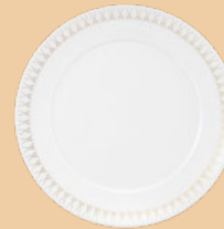
SERVICE PLATE, SWORDS RIM Ø 13" 79A221-41478-1