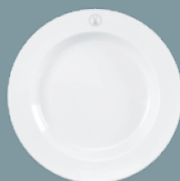
SOUP PLATE Ø 9" 79A223-41487-1