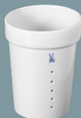
TEA STRAINER Ø 3 1/7", H 4" 000001-41700-1