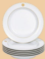
SOUP PLATE SET, 6-PIECES 6 SOUP PLATES 99A365-C4128-1