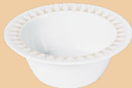
BOWL Ø 6 1/9" 79A221-41438-1