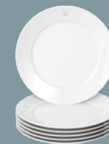
STARTER & DESSERT PLATE SET, 6-PIECES 6 STARTER & DESSERT PLATES 79A223-C4123-1