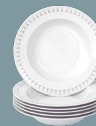
GOURMET PLATE SET, 6-PIECES 6 GOURMET PLATES 79A224-C4126-1