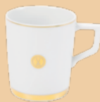
MUG V 8 4/9 OZ. 99A372-41575-1