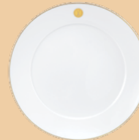
SERVICE PLATE, SWORDS MEDALLION Ø 13" 99A364-41478-1