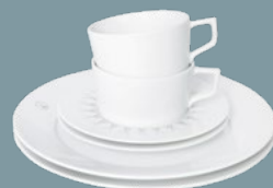
TEA SETTING SET, 6-PIECES 2 TEA CUPS, 2 TEA SAUCERS, 2 DESSERT PLATES 79A225-C4106-1