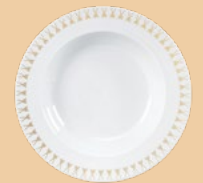
GOURMET PLATE, DEEP Ø 10 1/4" 79A221-41489-1