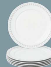
SERVICE PLATE SET, SWORDS RIM, 6-PIECES 6 SERVICE PLATES 79A224-C4127-1