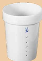
TEA STRAINER Ø 3 1/7", H 4" 000001-41700-1