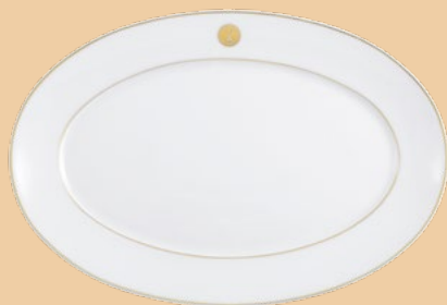
PLATTER, OVAL L 11 4/5" 99A365-41307-1