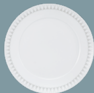
DINNER PLATE, SWORDS RIM Ø 11 3/7" 79A224-41479-1