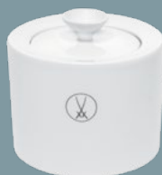
SUGAR BOWL H 3" 79A223-41823-1