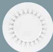
COFFEE/TEA/ CAPPUCCINO SAUCER, SWORDS RIM INSIDE Ø 5 5/7" 79A225-41562-1