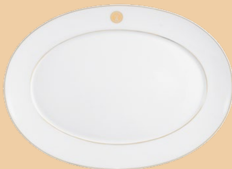
PLATTER, OVAL L 14 1/6" 99A365-41308-1