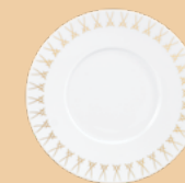
COFFEE/TEA/ CAPPUCCINO SAUCER, SWORDS RIM Ø 5 5/7" 79A221-41562-1