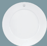
STARTER & DESSERT PLATE Ø 8 2/3" 79A223-41473-1