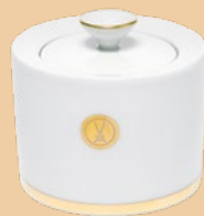
SUGAR BOWL H 3" 99A410-41823-1