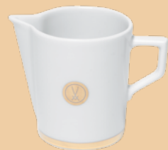
CREAMER V 5 OZ. 99A410-41762-1