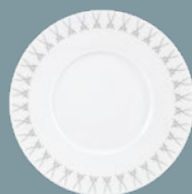
COFFEE/TEA/ CAPPUCCINO SAUCER, SWORDS RIM OUTSIDE Ø 5 5/7" 79A224-41562-1