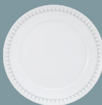
SERVICE PLATE, SWORDS RIM Ø 13" 79A224-41478-1