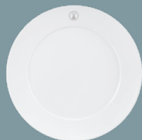
SERVICE PLATE, SWORDS MEDALLION Ø 13" 79A223-41478-1