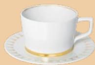
CAPPUCCINO CUP & SAUCER V 6 3/4 OZ. 99A370-41584-1