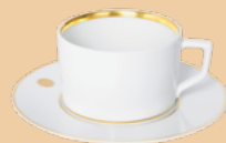
COFFEE CUP & SAUCER V 5 OZ. 99A369-41582-1