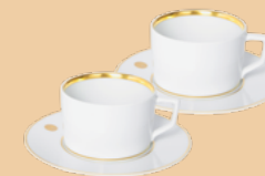
COFFEE CUP SET, 4-PIECES 2 COFFEE CUPS, 2 COFFEE SAUCERS 99A369-C4104-1