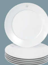
DINNER PLATE SET, SWORDS MEDALLION, 6-PIECES 6 DINNER PLATES 79A223-C4125-1