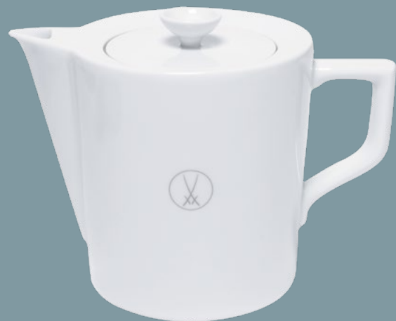
POT V 25 1/3 OZ. 79A223-41727-1