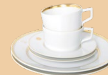
TEA SETTING SET, 6-PIECES 2 TEA CUPS, 2 TEA SAUCERS, 2 DESSERT PLATES 99A371-C4106-1