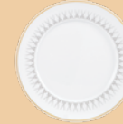
BREAD & BUTTER PLATE Ø 6 2/3" 79A222-41501-1