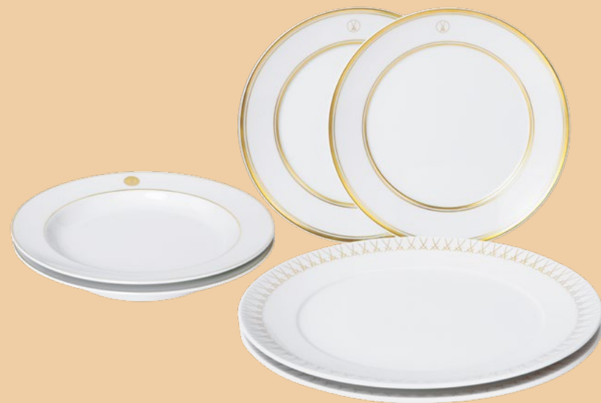
DINNER SET, 6-PIECES 2 STARTER & DESSERT PLATES, 2 SOUP PLATES, 2 DINNER PLATES 99A365-C4120-1