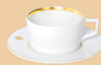
TEA CUP & SAUCER V 5 OZ. 99A371-41633-1