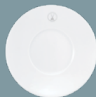
ESPRESSO SAUCER Ø 4 5/7" 79A223-41559-1