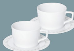
CAPPUCCINO CUP SET, 4-PIECES 2 CAPPUCCINO CUPS, 2 CAPPUCCINO SAUCERS 79A224-C4115-1