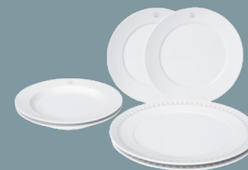
DINNER SET, 6-PIECES 2 STARTER & DESSERT PLATES, 2 SOUP PLATES, 2 DINNER PLATES 79A223-C4120-1