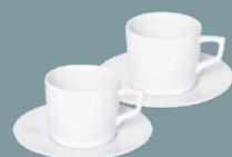
ESPRESSO CUP SET, 4-PIECES 2 ESPRESSO CUPS, 2 ESPRESSO SAUCERS 79A223-C4110-1