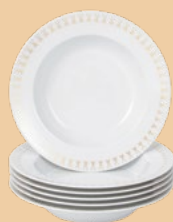
GOURMET PLATE SET, 6-PIECES 6 GOURMET PLATES 79A221-C4126-1