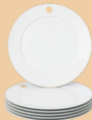
SERVICE PLATE SET, SWORDS MEDALLION, 6-PIECES 6 SERVICE PLATES 99A364-C4127-1