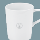
MUG V 8 4/9 OZ. 79A223-41575-1