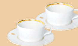
TEA CUP SET, 4-PIECES 2 TEA CUPS, 2 TEA SAUCERS 99A371-C4108-1