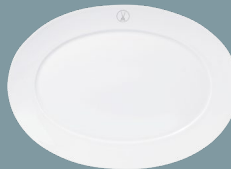
PLATTER, OVAL L 14 1/6" 79A223-41308-1