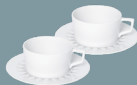
TEA CUP SET, 4-PIECES 2 TEA CUPS, 2 TEA SAUCERS 79A225-C4108-1