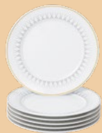
BREAD & BUTTER PLATE SET, 6-PIECES 6 BREAD & BUTTER PLATES 79A222-C4124-1