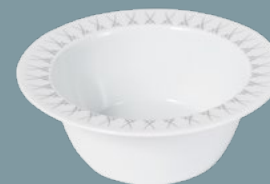
BOWL Ø 6 1/9" 79A225-41438-1