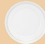
DINNER PLATE, SWORDS RIM Ø 11 3/7" 79A221-41479-1