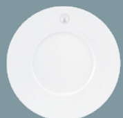
COFFEE/TEA/ CAPPUCCINO SAUCER, SWORDS MEDALLION Ø 5 5/7" 79A223-41562-1