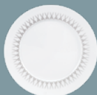
BREAD & BUTTER PLATE Ø 6 2/3" 79A227-41501-1