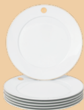
DINNER PLATE SET, SWORDS MEDALLION, 6-PIECES 6 DINNER PLATES 99A364-C4125-1