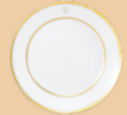
STARTER & DESSERT PLATE Ø 8 2/3" 99A367-41473-1