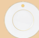
COFFEE/TEA/ CAPPUCCINO SAUCER, SWORDS MEDALLION Ø 5 5/7" 99A365-41562-1