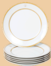
STARTER & DESSERT PLATE SET, 6-PIECES 6 STARTER & DESSERT PLATES 99A367-C4123-1