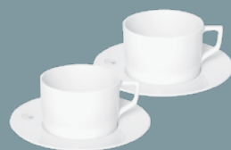
COFFEE CUP SET, 4-PIECES 2 COFFEE CUPS, 2 COFFEE SAUCERS 79A223-C4104-1