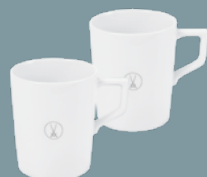
MUG SET, 2-PIECES 2 MUGS 79A223-C4117-1