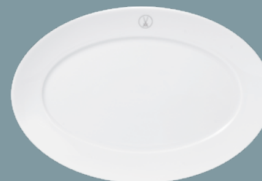
PLATTER, OVAL L 11 4/5" 79A223-41307-1