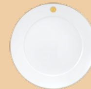
DINNER PLATE, SWORDS MEDALLION Ø 11 3/7" 99A364-41479-1