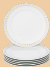
DINNER PLATE SET, SWORDS RIM, 6-PIECES 6 DINNER PLATES 79A221-C4125-1