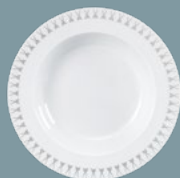
GOURMET PLATE, DEEP Ø 10 1/4" 79A224-41489-1