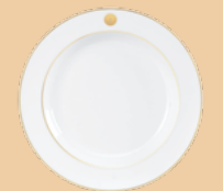
SOUP PLATE Ø 9" 99A365-41487-1