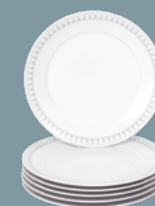
DINNER PLATE SET, SWORDS RIM, 6-PIECES 6 DINNER PLATES 79A224-C4125-1