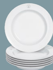
SOUP PLATE SET, 6-PIECES 6 SOUP PLATES 79A223-C4128-1