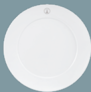
DINNER PLATE, SWORDS MEDALLION Ø 11 3/7" 79A223-41479-1