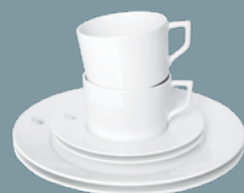
COFFEE SETTING SET, 6-PIECES 2 COFFEE CUPS, 2 COFFEE SAUCERS, 2 DESSERT PLATES 79A223-C4102-1