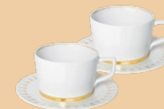
CAPPUCCINO CUP SET, 4-PIECES 2 CAPPUCCINO CUPS, 2 CAPPUCCINO SAUCERS 99A370-C4115-1