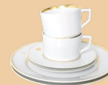
COFFEE SETTING SET, 6-PIECES 2 COFFEE CUPS, 2 COFFEE SAUCERS, 2 DESSERT PLATES 99A369-C4102-1