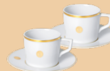
ESPRESSO CUP SET, 4-PIECES 2 ESPRESSO CUPS, 2 ESPRESSO SAUCERS 99A368-C4110-1