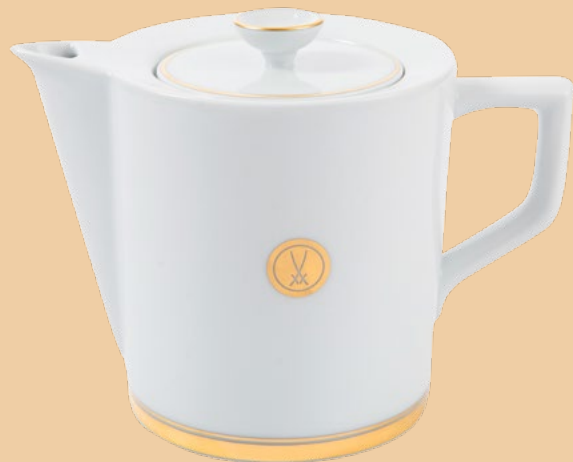
POT V 25 1/3 OZ. 99A411-41727-1