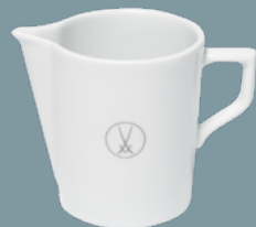
CREAMER V 5 OZ. 79A223-41762-1