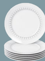
BREAD & BUTTER PLATE SET, 6-PIECES 6 BREAD & BUTTER PLATES 79A227-C4124-1