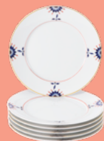
BREAD & BUTTER PLATE SET, 6-PIECES 6 BREAD & BUTTER PLATES 802390-C4124-1