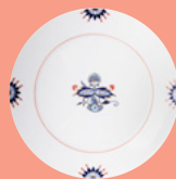
STARTER & DESSERT PLATE Ø 8 2/3 " 802790-41473-1