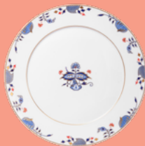
SERVICE PLATE Ø 13 " 803190-41478-1