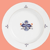
SOUP PLATE Ø 9 " 802890-41487-1