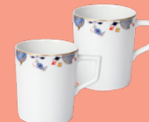
MUG SET, 2-PIECES 2 MUGS 802190-C4117-1