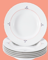
GOURMET PLATE SET, 6-PIECES 6 GOURMET PLATES 802490-C4126-1