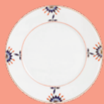
BREAD & BUTTER PLATE Ø 6 2/3 " 802390-41501-1