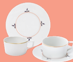
TEA CUP SET, 4-PIECES 2 TEA CUPS, 2 TEA SAUCERS 802490-C4108-1