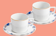
ESPRESSO CUP SET, GOLD RIM, 4-PIECES 2 ESPRESSO CUPS, 2 ESPRESSO SAUCERS 803090-C4110-1