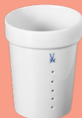
TEA STRAINER Ø 3 1/7", H 4" 000001-41700-1