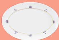
PLATTER, OVAL L 11 4/6 " 802990-41307-1