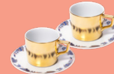
ESPRESSO CUP SET, 4-PIECES 2 ESPRESSO CUPS, 2 ESPRESSO SAUCERS 803290-C4110-1