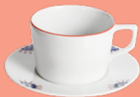
CAPPUCCINO CUP & SAUCER V 6 3/4 OZ. 802290-41584-1