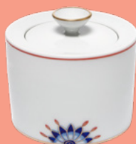
SUGAR BOWL H 3" 802390-41823-1