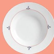
GOURMET PLATE, DEEP Ø 11 4/5 " 802490-41489-1