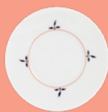
COFFEE/TEA/ CAPPUCCINO SAUCER Ø 5 5/7" 802490-41562-1