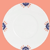
COFFEE/TEA/ CAPPUCCINO SAUCER Ø 5 5/7" 802290-41562-1