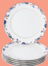
DINNER PLATE SET, 6-PIECES 6 DINNER PLATES 802190-C4125-1