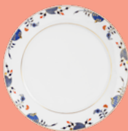
DINNER PLATE Ø 11 3/7 " 802190-41479-1