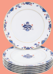
SERVICE PLATE SET, 6-PIECES 6 SERVICE PLATES 803190-C4127-1