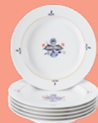
SOUP PLATE SET, 6-PIECES 6 SOUP PLATES 802890-C4128-1