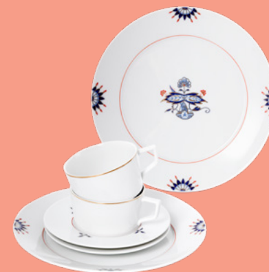
TEA SETTING SET, 6-PIECES 2 TEA CUPS, 2 TEA SAUCERS, 2 DESSERT PLATES 802790-C4106-1