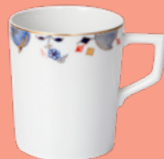
MUG V 8 4/9 OZ. 802190-41575-1