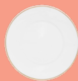
COFFEE/TEA/CAPPUCCINO SAUCER, GOLD RIM Ø 5 5/7" 98A077-41562-1