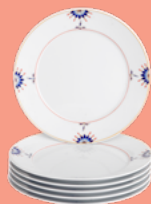
STARTER & DESSERT PLATE SET, 6-PIECES 6 STARTER & DESSERT PLATES 802390-C4123-1