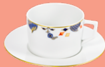
COFFEE CUP & SAUCER V 5 OZ. 802190-41582-1