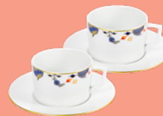
COFFEE CUP SET, 4-PIECES 2 COFFEE CUPS, 2 COFFEE SAUCERS 802190-C4104-1