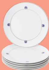
DINNER PLATE SET, 6-PIECES 6 DINNER PLATES 802590-C4125-1