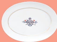
PLATTER, OVAL L 14 1/6 " 802690-41308-1