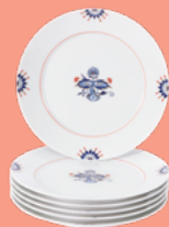
STARTER & DESSERT PLATE SET, 6-PIECES 6 STARTER & DESSERT PLATES 802790-C4123-1