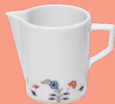
CREAMER V 5 OZ. 803490-41762-1