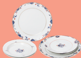
DINNER SET, 6-PIECES 2 STARTER & DESSERT PLATES, 2 SOUP PLATES, 2 DINNER PLATES 802790-C4120-1