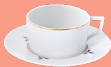
TEA CUP & SAUCER V 5 OZ. 802490-41633-1