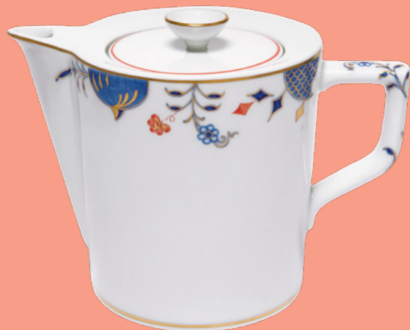
POT V 25 1/3 OZ. 802190-41727-1