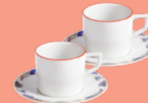
ESPRESSO CUP SET, RED RIM, 4-PIECES 2 ESPRESSO CUPS, 2 ESPRESSO SAUCERS 803390-C4110-1