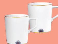
MUG SET, 2-PIECES 2 MUGS 802590-C4117-1