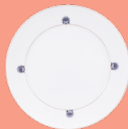
DINNER PLATE Ø 11 3/7 " 802590-41479-1