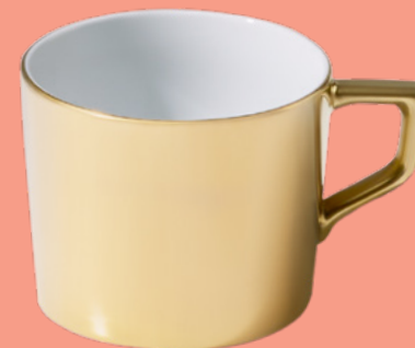
ESPRESSO CUP, GOLD V 3 3/8 OZ. 99A114-41569-1