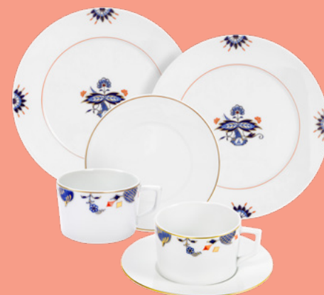
COFFEE SETTING SET, 6-PIECES 2 COFFEE CUPS, 2 COFFEE SAUCERS, 2 DESSERT PLATES 802790-C4102-1