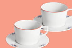
CAPPUCCINO CUP SET, 4-PIECES 2 CAPPUCCINO CUPS, 2 CAPPUCCINO SAUCERS 802290-C4115-1