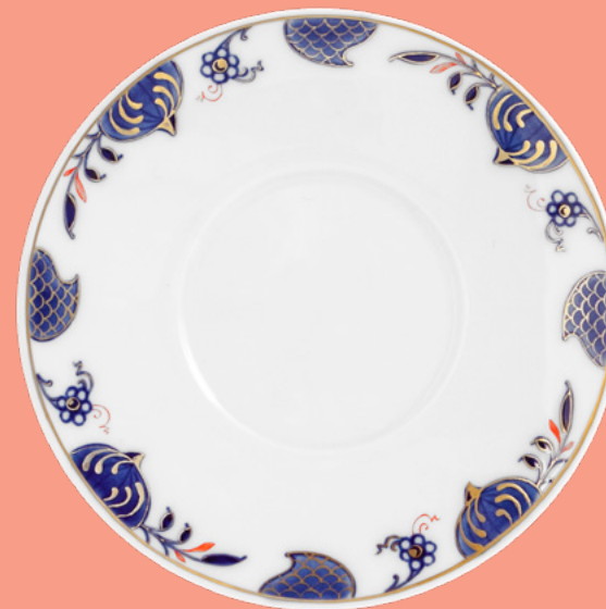
ESPRESSO SAUCER Ø 4 5/7" 803090-41559-1