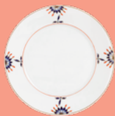
STARTER & DESSERT PLATE Ø 8 2/3 " 802390-41473-1