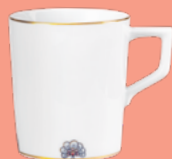
MUG V 8 4/9 OZ. 802590-41575-1