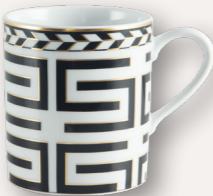
Mug MEISSEN® COSMOPOLITAN V 0,25 l 79B475-36575