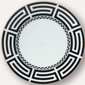
Dinner Plate, large MEISSEN® COSMOPOLITAN Ø 30 cm 79B475-37479