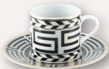
Espresso Cup MEISSEN® COSMOPOLITAN V 0,05 l 79B475-36579