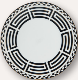
Dinner Plate, small MEISSEN® COSMOPOLITAN Ø 24 cm 79B475-37475