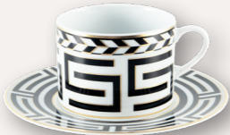
Coffee Cup MEISSEN® COSMOPOLITAN V 0,15 l 79B475-36582