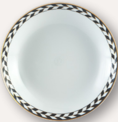
Soup Plate MEISSEN® COSMOPOLITAN Ø 20,5 cm 79B475-37487