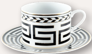
Cappuccino Cup MEISSEN® COSMOPOLITAN V 0,25 l 79B475-36584